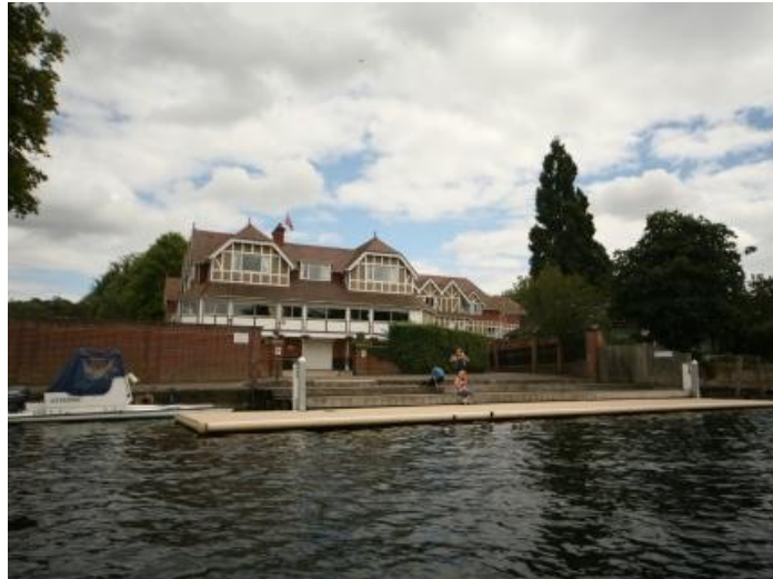
The Leander Club, Henley

Chapter membership in 1970 stood at sixteen by 1979 twenty two.